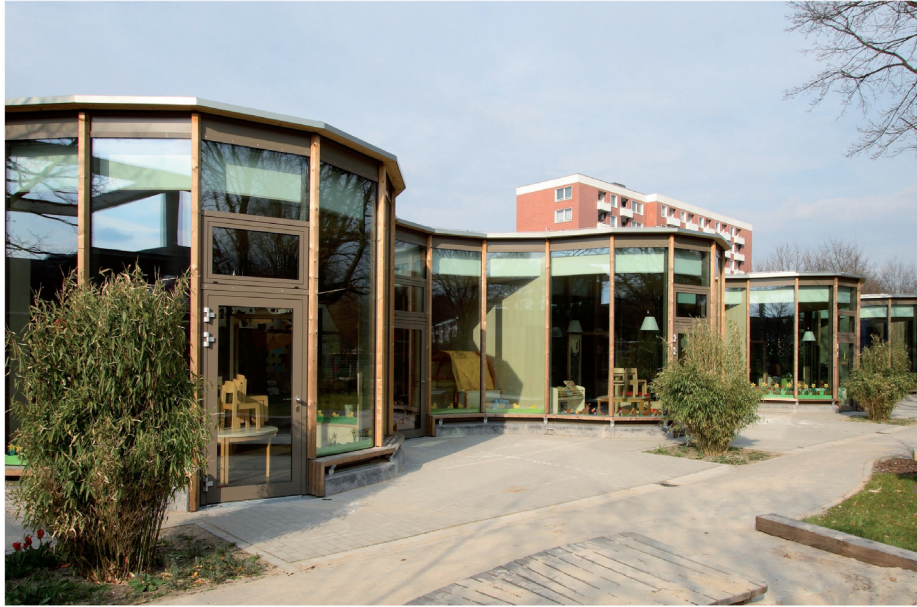
↑ | Exterior view ← | Detail, façade